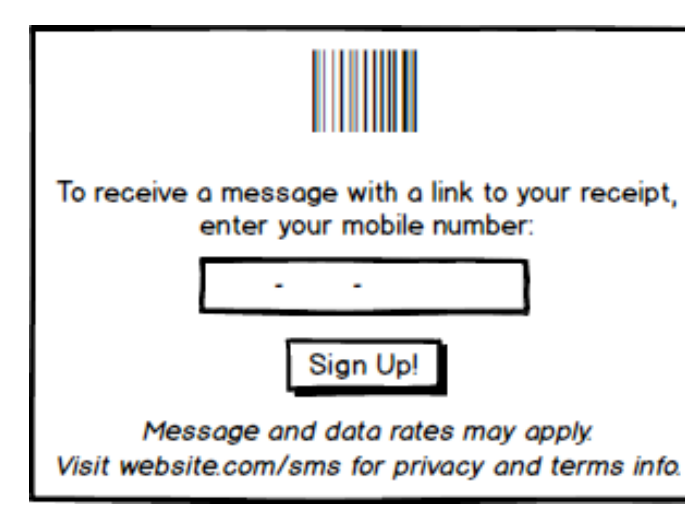
Exhibit A6: Sample Compliant Single-Message POS Advertisement and Service Messages

"You're now opted out and will no longer receive Lifetime Trip wait list alerts."