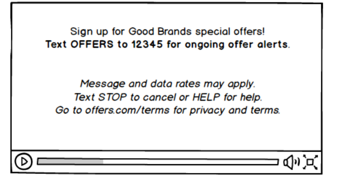
Exhibit B2: Sample Compliant Recurring-Messages TV Advertisement and Service Messages